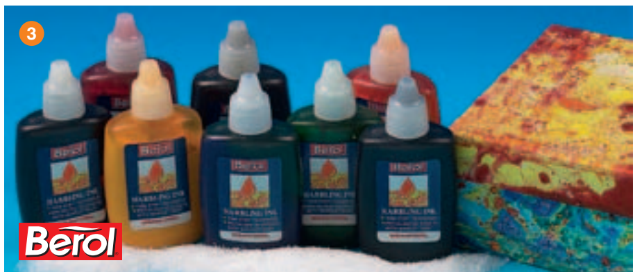
Creates Fantastic Effects